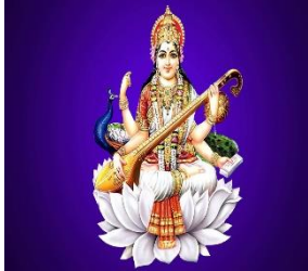
Saraswati goddess for the creative arts